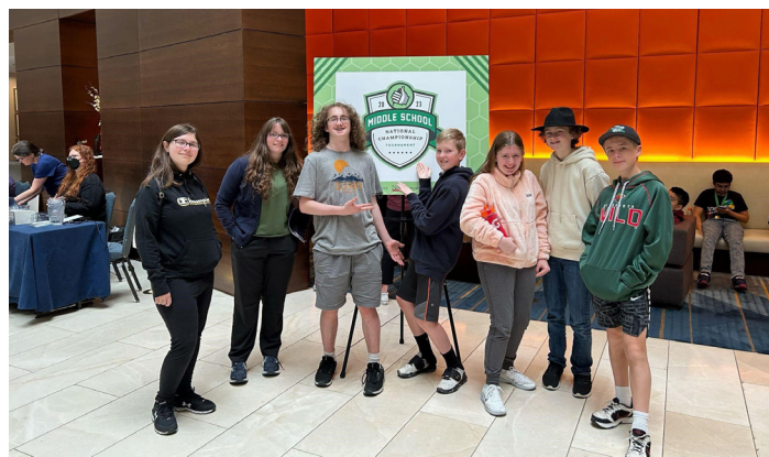
Spectrum's Middle School Quiz Bowl team pose in front of a poster at this year's national championship in Chicago.

Spectrum's High School Quiz Bowl team attended the national championship April 28-30 and finished with a 6-7 record. They did very well for a 10th grade and younger team. There is fantastic competition at the National Quiz Bowl Tournament. Spectrum can be proud that this team absolutely held their own.