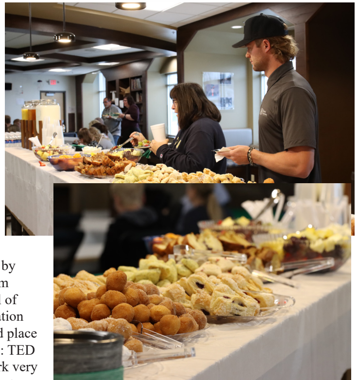
Breakfast was provided for students, families, and community members at the scholarship awards banquet.

The school's Senior Capstone winners are also recognized at this banquet. Senior Capstone is a culminating and exploratory course in which students find their connection to the community by doing a service project with an outside organization. The magnum opus of Senior Capstone is presenting their experience to a panel of representatives from the local community that judge the presentation and aid in the selection of six winners. There is a first and second place from each of the following three types of presentation categories: TED Talk, Traditional Presentation, and Video Montage. Students work very hard throughout their high school careers on their Capstone projects and Spectrum is honored to recognize them.