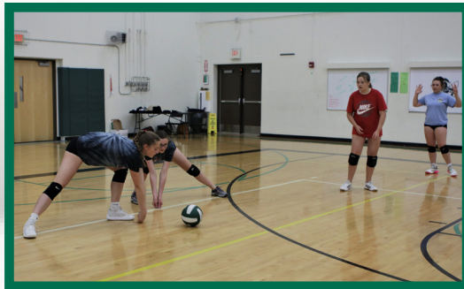
Volleyball players practiced drills and team-building exercises.