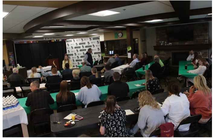
Attendees mingle over breakfast before the start of the award presentations.