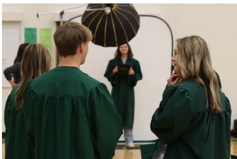
Students wait in line to take formal photos in their cap and gowns for graduation.

absorbed all the possibilities that lie before them, and the excitement of the staff to learn of the future plans of their former students. There was nearly 100% participation from our seniors as they enjoyed one final afternoon interacting and mingling with their peers as the page turned to end one chapter and begin the next chapter of their lives!