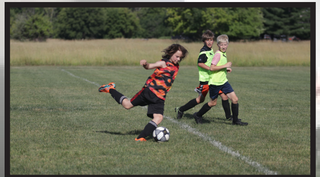
Soccer camps prepared students for the fall season!