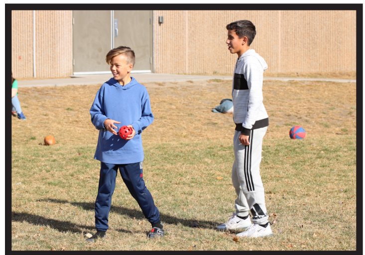
All smiles on the middle school phy-ed field during recess, complete with a warm October day!

Every year hundreds of students and their families tour the two Spectrum Middle School (SMS) campuses. SMS sixth grade is one of only three schools in the state of Minnesota that houses just sixth-grade students while the 7th and 8th grade campus configuration is also unique. These configurations allow for many wonderful opportunities in events and programs, creating an interest for the surrounding community members to come see what Spectrum is all about.