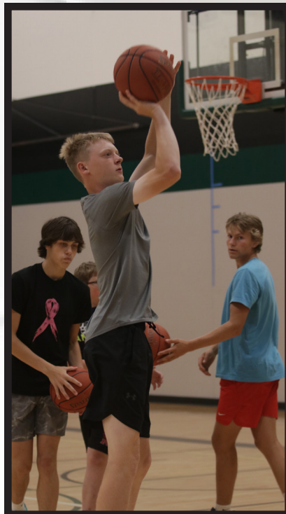
A rotation of shooting is shown by the boys' basketball team.