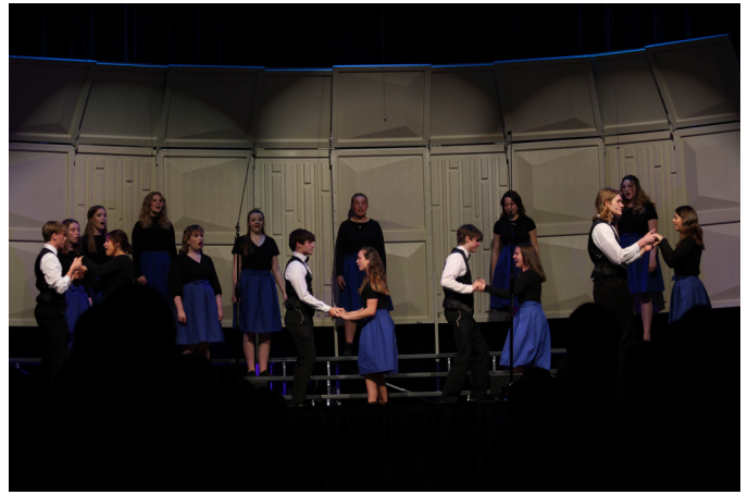
Members of Harmenix joined MeLadies on stage for dance choreography during Meladies' performance.

The ladies vocal group, MeLadies, performed prior to the Chamber Choir. The group began with "Will The Circle Be Unbroken" followed by "Cantar!" that included choreography that involved both Meladies and Harmenix members. They concluded with a powerful performance of "The Runner".