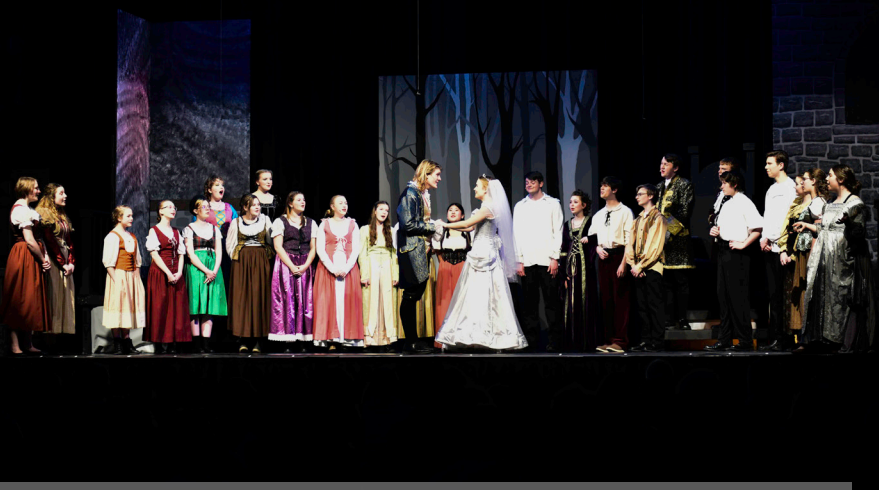
The characters of the cast gather around during the wedding of Cinderella and Prince Christopher.

When lights came up at 7:00 p.m., all of their efforts came to life on stage in a masterful, funny, and emotional performance of Roger and Hammerstein's Cinderella. Followed by