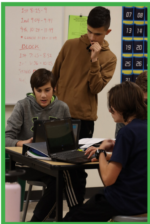
A group of WIN (What I Need) leaders develop plans to help with incoming 6 Grade students.

Sixth Grade Orientation is an event held in August a few weeks before the beginning of the school year. It welcomes all new learners to the district and gets them excited to start their middle school experience. Eighth grade student leaders give them a tour of the campus, guide them through their bell schedule, show them their locker, get them logged into Schoology with their Chromebook, and connect them with fellow peers so that the first day of school is exciting and a little less scary. This event has become the traditional way in which Spectrum families first become a part of the middle school learning community.