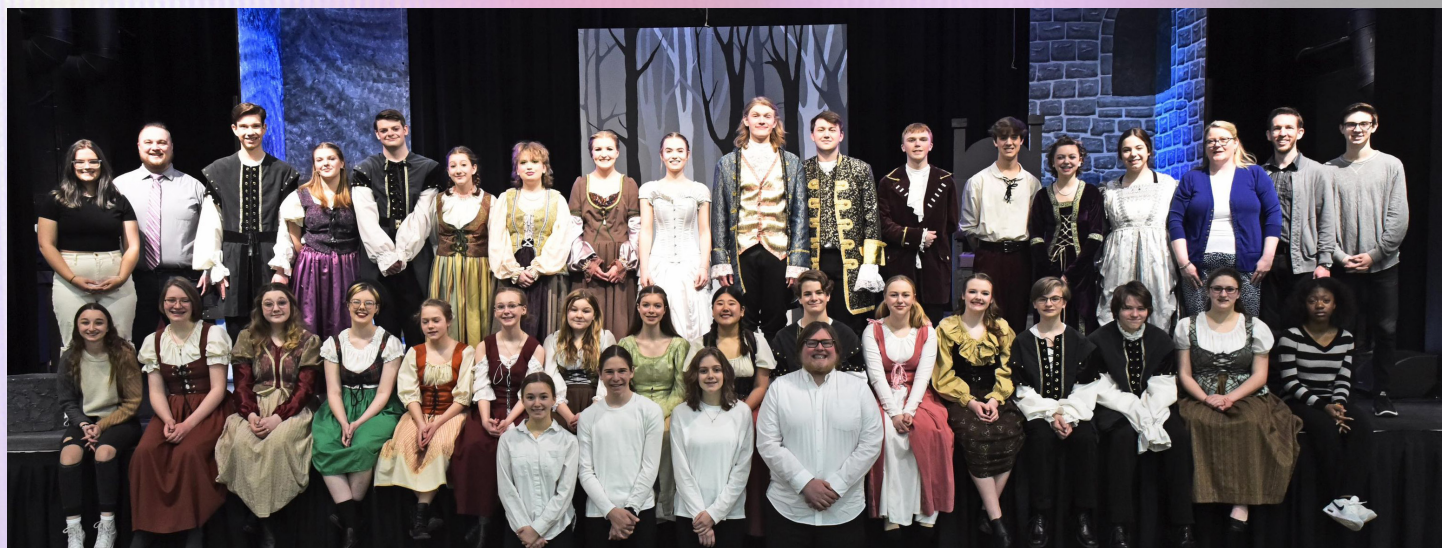
The cast & crew of the 2023 production of Cinderella.

The final performance was full of emotion as the theater department recognized almost a dozen seniors, taking their Final Bow on the Spectrum Stage, a long standing tradition developed by Ms. Tyler. The bonds that had been formed amongst the cast and crew were obvious to all during these final moments together on stage.