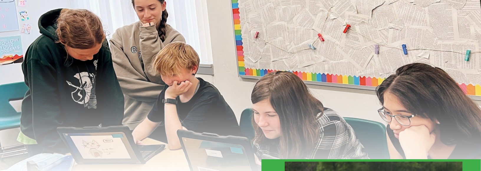
Students during Sting Time are shown studying for their author's point of view and purpose assessment that will be due in literature.

grade teachers? How are tests, projects, and homework different? How are classes the same? Which ones are different? What is expected of a 7th grader that is different from a 6th grader? These and many other questions and any personal concerns are addressed in the spring of the 6th graders' year so they are ready to be 7th graders in the fall.