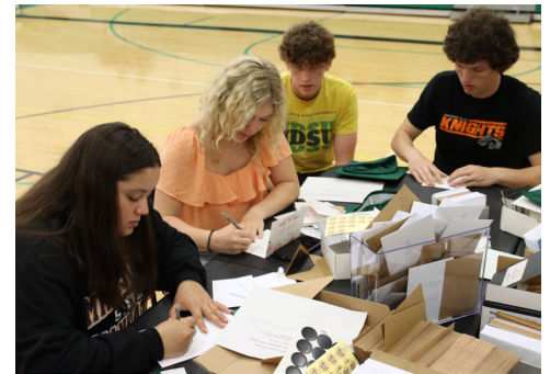
Groups of students took time to write thank you cards to teachers and staff who impacted them.