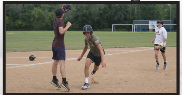
Sting athletes shown on the baseball field.

"It's not about the number of hours you practice, it's about the number of hours your mind is present during the practice."