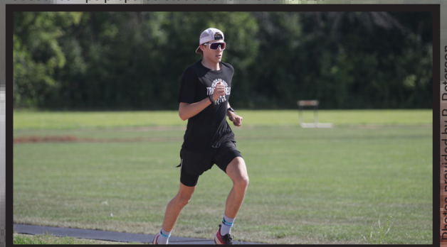
The summer sun didn't stop the Sting athletes from getting on the track.