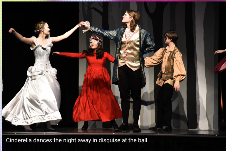
Cinderella dances the night away in disguise at the ball.

"The bonds that had been formed amongst the cast and crew were obvious to all during these final moments together on stage."