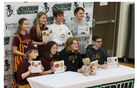
Students gather around Spectrum's decision table.

absorbed all the possibilities that lie before them, and the excitement of the staff to learn of the future plans of their former students. There was nearly 100% participation from our seniors as they enjoyed one final afternoon interacting and mingling with their peers as the page turned to end one chapter and begin the next chapter of their lives!